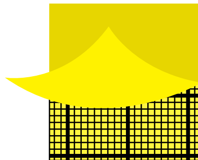
9x9 Ripstop Scrim (Duravider with Ripstop 14 & 18 oz.)