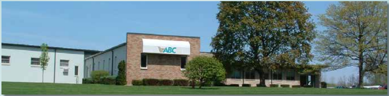
ABC's headquarters in Winona Lake, Indiana