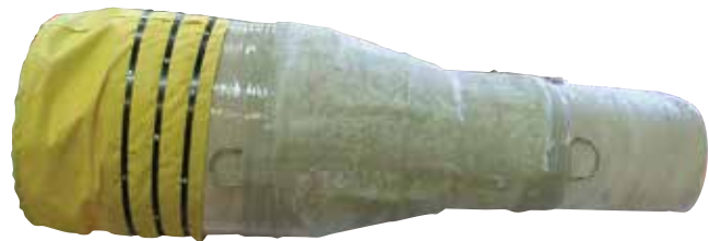
REDUCER WITH MINEDUCT®**